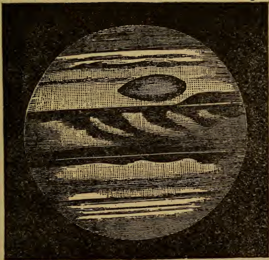
A telescopic view of a Vapor Canopy on the Planet Jupiter, showing an aqueous-mineral ocean many thousand miles deep, now falling in grand installments at the poles of that planet.